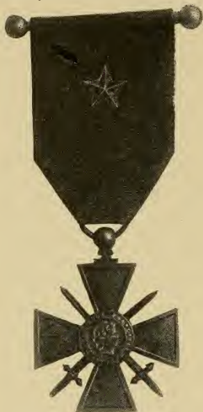
CROIX DE GUERRE

One beautiful, romantic feature of French army life is the adoption of soldiers by god-mothers. In one instance, a girl fifteen years of age, having enough money, adopted a half dozen. One of them proved to be a Senegalize, who wished to take the young lady back to Africa to complete his harem!